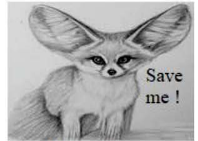
The fennec fox

Solutions : 1- To protect it in preserves/ 2- to stop hunting it/ 3- to not take it from the desert.