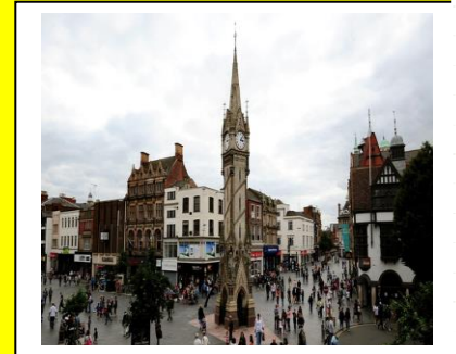
The clock Tower